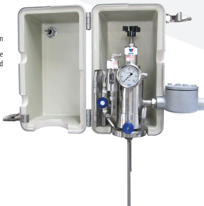
R: P 2 Electrical Connection Option Shown

Product and/or components are manufactured under US Patent: 6,764,536 and 7,471,882