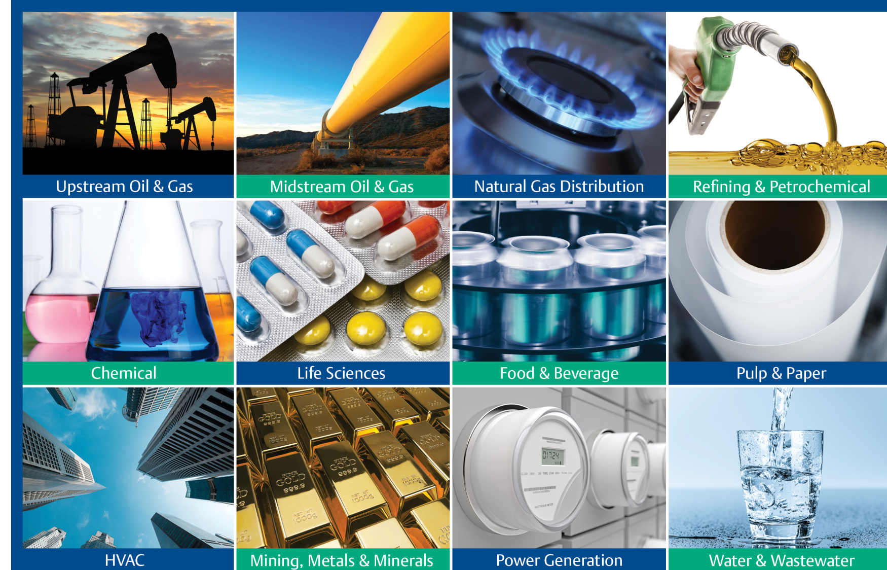
Emerson Impact Partners engineer and deliver solutions across a broad range of industries throughout North America.

The process automation experience, expertise, and solutions you need. Near you. Across North America.