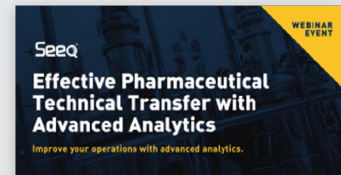
Webinar: Effective Pharmaceutical Technical Transfer with Advanced Analytics