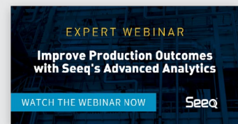
Webinar: Improve Production Outcomes with Seeq's Advanced Analytics