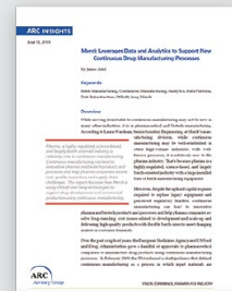
Case Study: Merck Leverages Data and Analytics to Support New Continuous Drug Manufacturing Processes