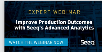
Webinar: Improve Production Outcomes with Seeq's Advanced Analytics